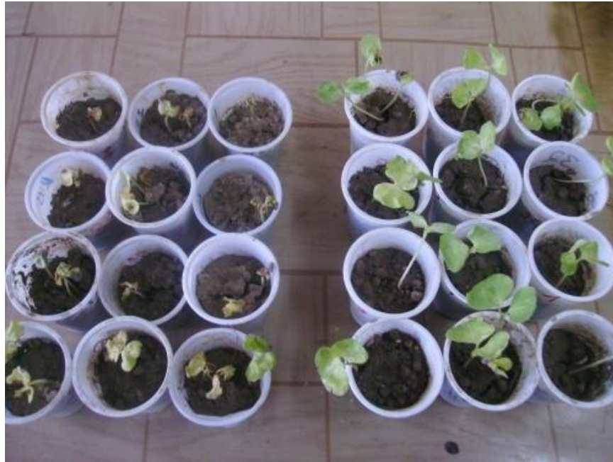
Figure 3.2 The biological control of cotton root rot caused by F. oxysporum by biological control agent P. extremorientalis TSAU20